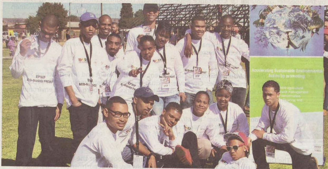
The team who aim to create environmental awareness.