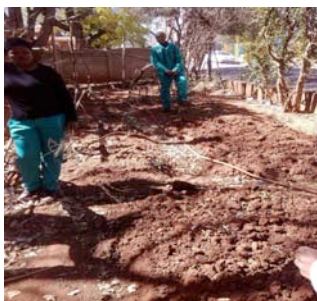
Revamping of Berea Primary food garden