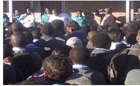
Midrand Team at Kaalfontein Primary