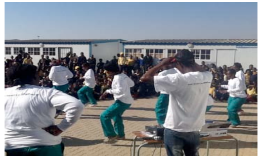
Cosmo City Team Performing at Cosmo Secondary