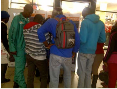
Exhibition on Biodiversity Pan Africa Mall