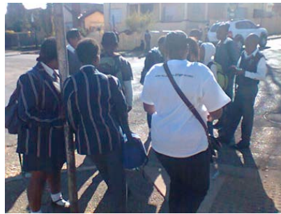
ClimateChange survey Malvern