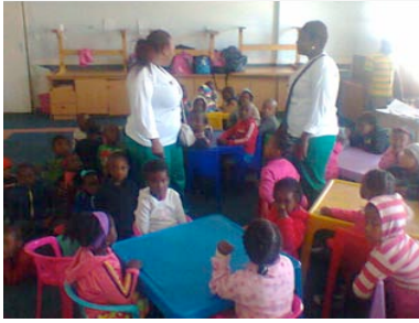
School Programme Restoration Welfare and School Programme Katia Crèche and Day Care