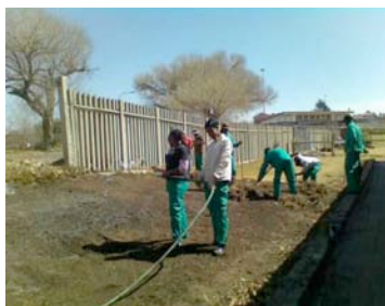
Food garden at Moroka Horse Riding Club in Soweto