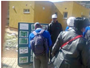
Exhibition on Biodiversity Pan Africa Mall